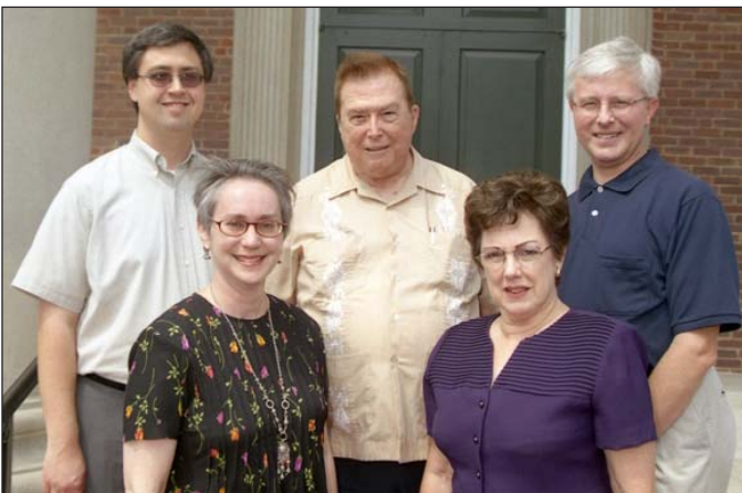
CONVENTION EXECUTIVE STEERING COMMITTEE