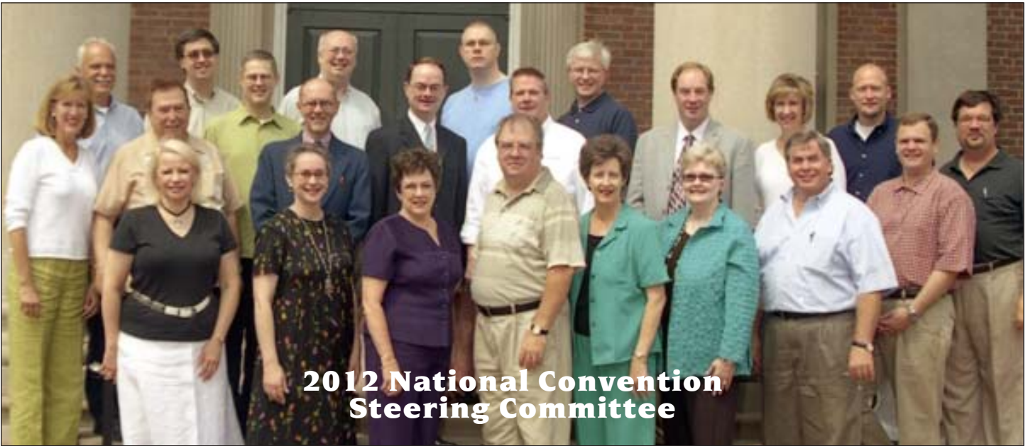
2012 National Convention Steering Committee