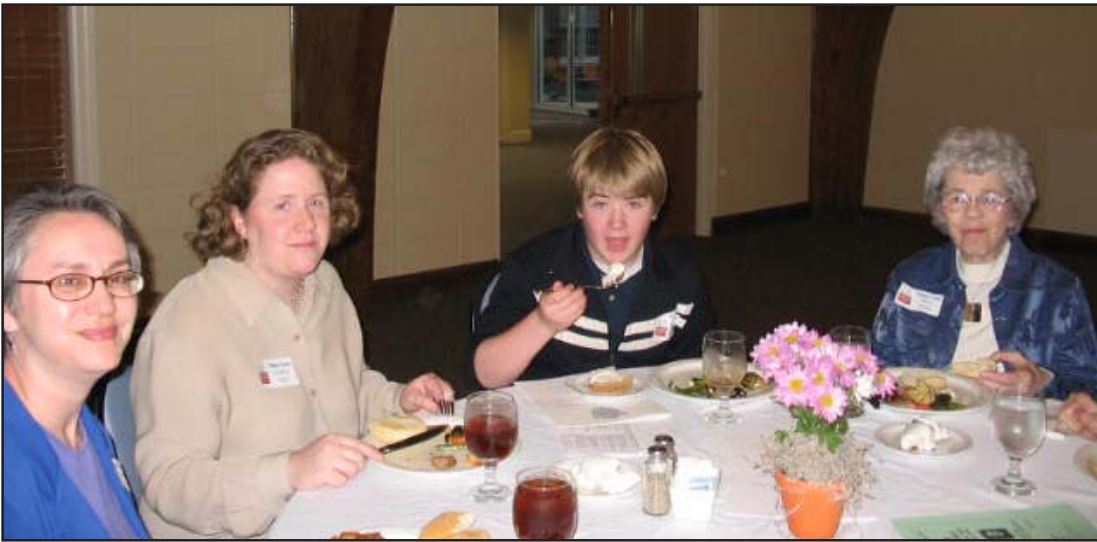
Happy Faces from our April Meeting at Westminster