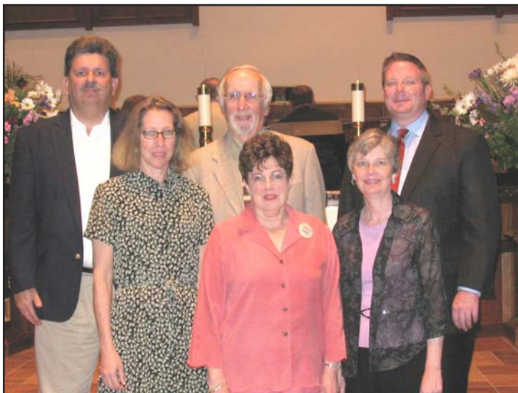
Newly installed officers at the May meeting.